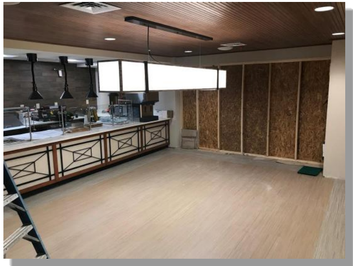
Dining Room Bistro