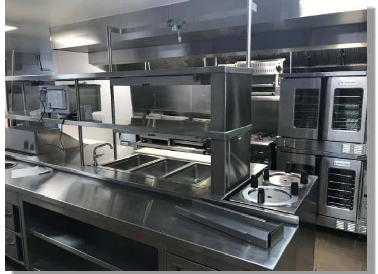
Commons Permanent Kitchen