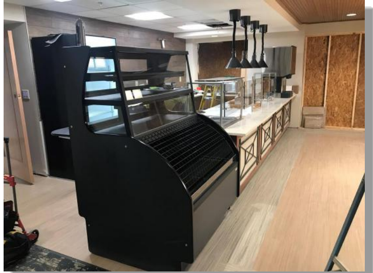
Dining Room Bistro