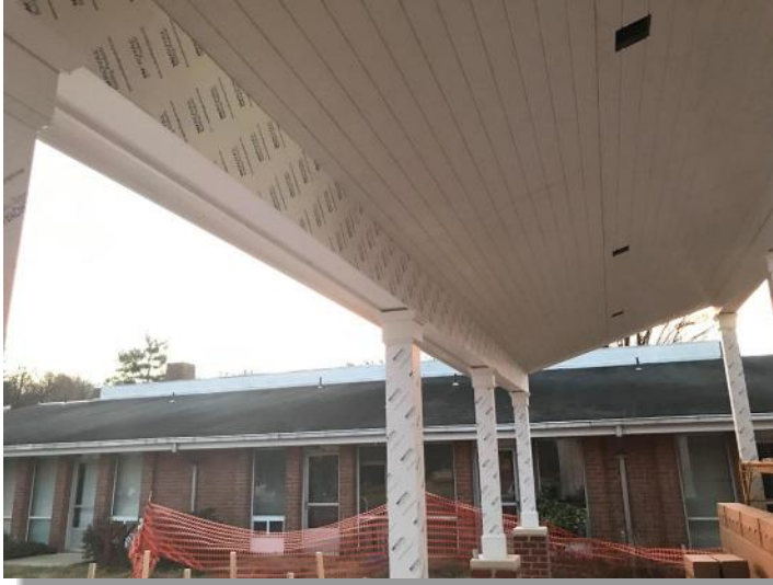
Commons Front Entrance